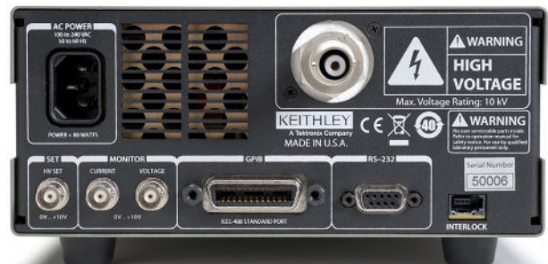
2290-10 rear panel showing the IEEE-488 interface connector, RS-232 interface connector, high voltage output connector, analog control/output connectors, and interlock connector.