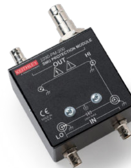
The 2290-PM-200 Protection Module protects low voltage measurement equipment from voltages greater than 200V.

Series 2290 Power Supplies and a 2290-PM-200 SMU Protection Module protect both user and instrumentation from hazardous voltages. An interlock circuit built into the power supplies can be used to ensure that the output voltage is disabled if a high voltage test fixture access door is open. In addition, all Series 2290 power supplies have low voltage analog outputs to permit safe monitoring of the high voltage and the output current.